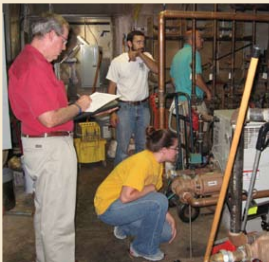
A Green Building energy audit at Northwood Christian Church, Indianapolis.