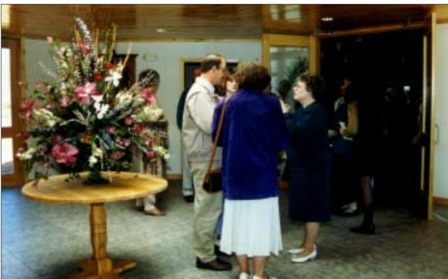
Following worship, the gathering space can serve as an area for fellowship.

The narthex is the hub of circulation where one enters and finds easy access to all parts of the building.