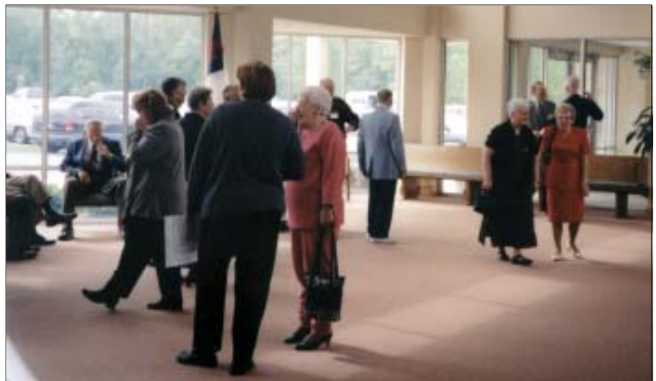
The gathering space is like a “village well” for the congregation.

The narthex is one key to a good church building. From this central place, all other parts of the building should be easily and directly reached. The narthex should serve as a center